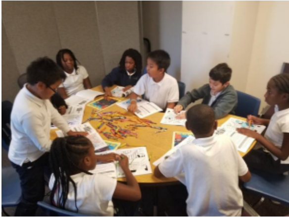
BRK Classroom Workshop

Facebook / Instagram / Twitter / YouTube / LinkedIn