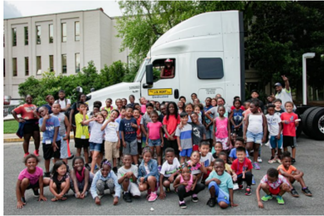
BRK "Touch-A-Truck" Career Program